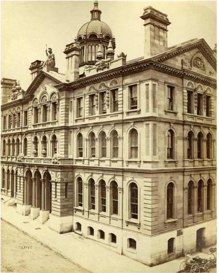
Custom House - Halifax, Nova Scotia, showing the corner of Hollis Street + Cheapside Notman Studio - Nova Scotia Archives accession no. 1983-310 number 39063

If you have a mobile phone with a GPS tracking app, please turn the app on now, and make a track of this walk. After the walk, please send your recorded track to us at: