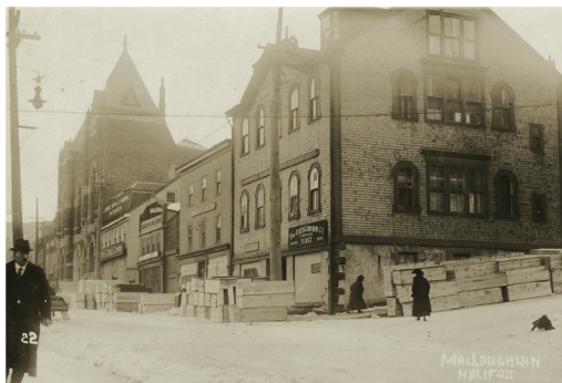
Argyle Street at the Corner of George Street, Halifax.

Snake your way silently, in a smooth, single line, though Terroir: A Nova Scotia Retrospective . Do you see yourself here? Join us in the courtyard for a seasonal snack, from Common Roots Urban Farm. Our keepsake gift to you at the end of Downhill from Here is a hand held device, a tool for uncharted movement.