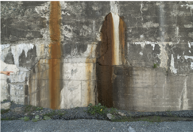
Retaining Wall Halifax Shipyard

We will go back along Veith Street, and cross into Mulgrave Park by the basketball court. Notice the many new murals, created by the Blackbook Collective and other artists during the Paint the Park festival held in October.