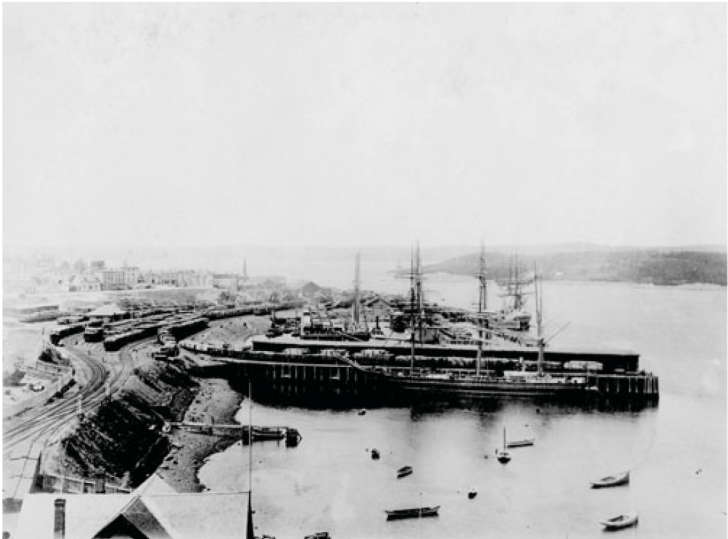
Richmond Piers by Gauvin and Gentzel, ca. 1898

https://twitter.com/NiSTSNS#halifaxexplosion