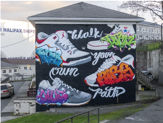
Mural brought to you by the Blackbook Collective

If you have a smartphone with a GPS tracking app, please turn the app on now, and make a track of this walk. After the walk, you may send your recorded track to us at: nistyh@gmail.com